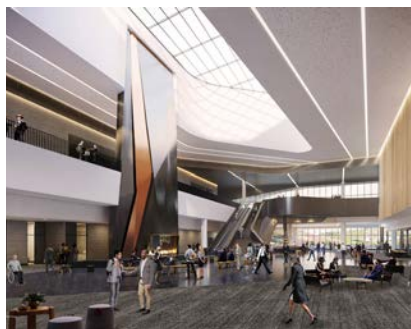
Renderings of the BMO expansion, expected to be completed in 2024.