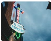
King Edward Hotel

438 9 Avenue Southeast, Calgary, Alberta, CA, T2G